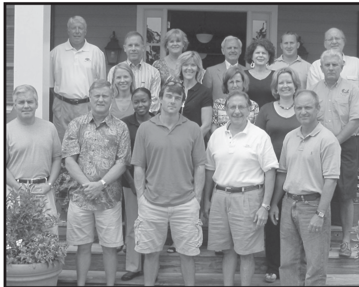
Attendees of the Eastern Shore Chamber Reboot Retreat:

"We are all 'the Chamber'," he said. "We need to get our members involved. We need to set the example to others - bringing in new businesses, growing and supporting our existing businesses."